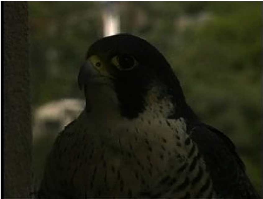
Peregrine falcon nesting on the 40 th floor of the Cathedral of Learning