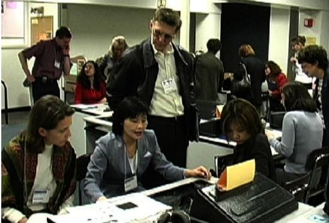
Multimedia showcase - a new tradition for NEALLT?

http://www.polyglot.pitt.edu/events/neallt2002/showcase.html